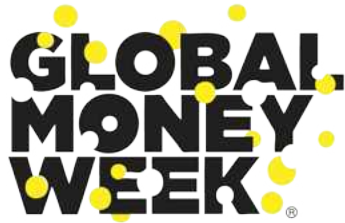
Example of logo in two color variation