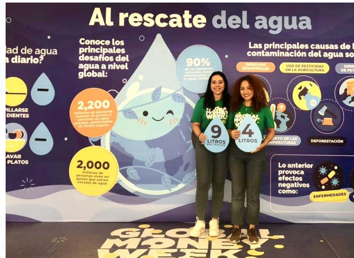
Rescue of water.