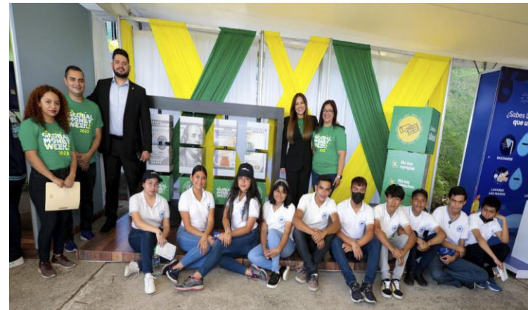
Know your money.