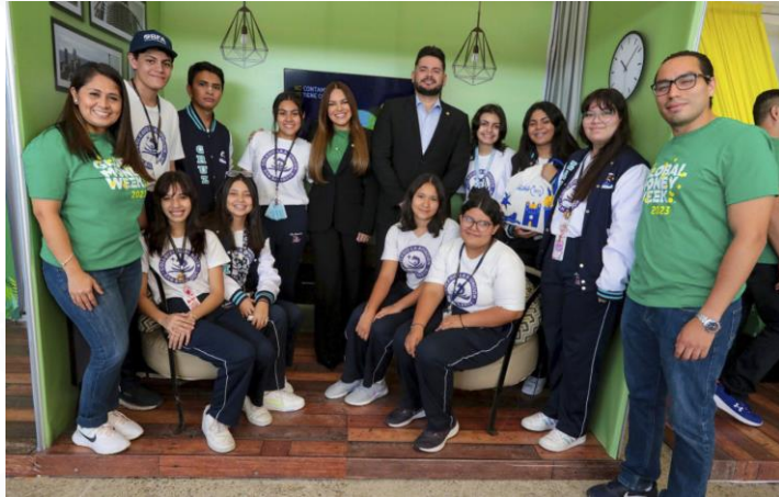
The challenge of saving.